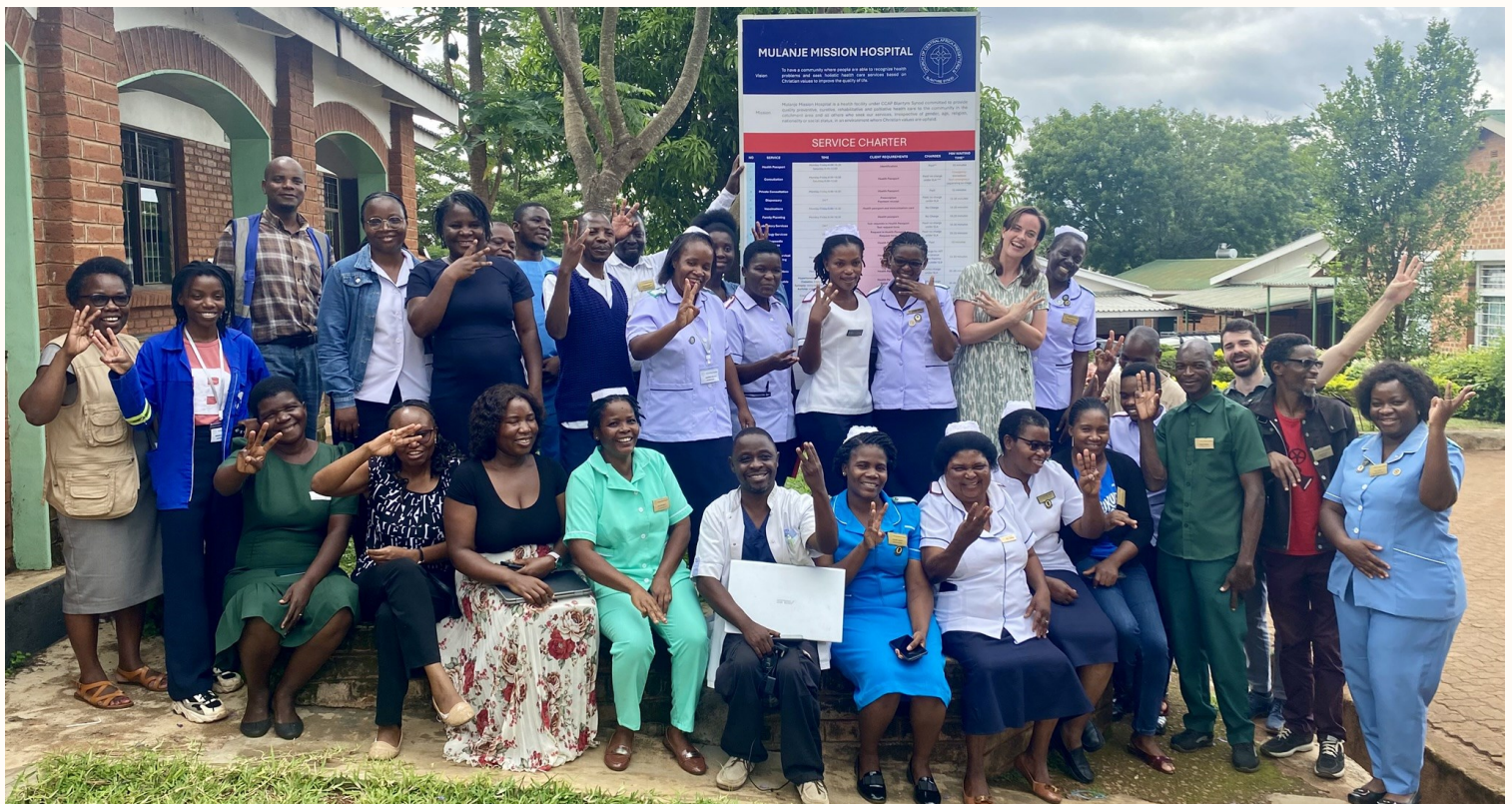
▲ Group Picture After Receiving the Results

MMH is confident that a 4 star status can be achieved by the end of 2026. Management, the quality improvement team and the entire staff are geared to work towards this goal. Merry Christmas and a Happy New Year to our followers as we work together to make patient care safer through quality improvement.