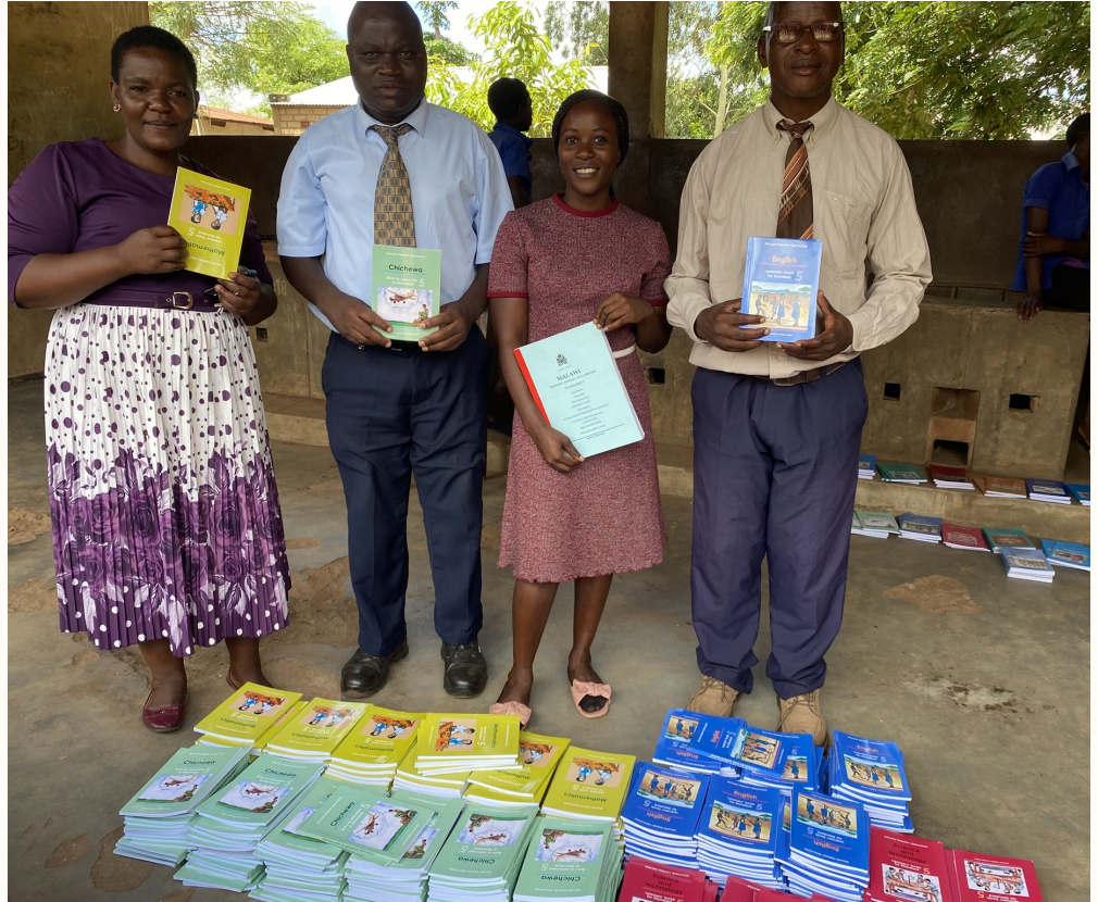
▲ Teachers receiving books and teacher guides

Mulanje Mission Hospital believes that education and health go hand in hand. We thank Focus Accretio for the trust and support that made this project possible. Together, we bring stronger learning opportunities to our children and hope for a better future.