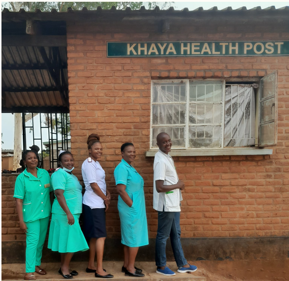
▲ The Cervical Cancer Screening Team at Khaya Healthpost

Mulanje Mission Hospital will continue to raise awareness about the preventable nature of cervical cancer, encourage women to attend regular screening and advocate for expanded HPV vaccination to protect future generations.