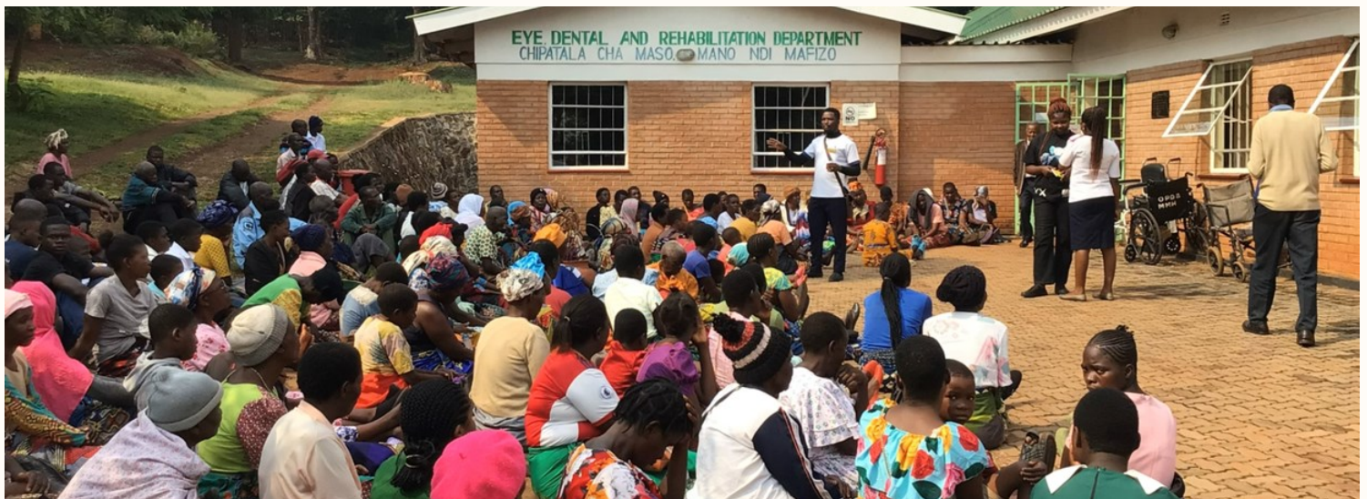
▲ World Sight Day, 9 October 2025

Thank you for standing with Mulanje Mission Hospital and with everyone who wants to see again.