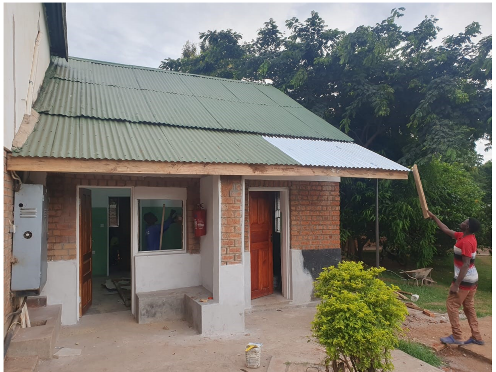
▲ Tuberculosis office under renovation (left). Next door will be the IT-office and Ombudswoman's consulting room.

Some areas were worked on right away, such as lack of communication and phone credit, but others needed more investment, for example in a