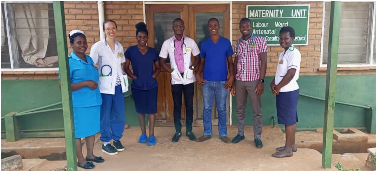
Δ Part of the team which has written the new maternity protocols

with over 100 pages, soon available on our clinical app too. MMH is proud of this joined, fruitful effort. Last step is a final revision by an obstetrician from the central hospital, after which training and implementation will be take place. To be continued...!