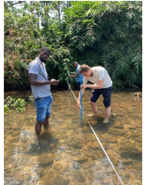
Testing water in the field

Within the walls of Mulanje Mission Hospital, I am actively engaged in improving the water supply to the hospital by installing water filters and implementing the continued chlorination of borehole water. As a student, I am