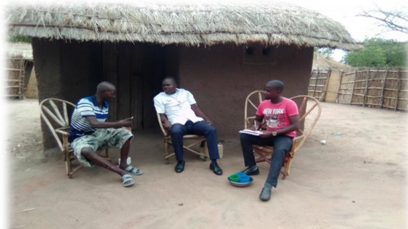
Picture 10: A home visit during mentorship session at Montfort Hospital in Chikwawa District